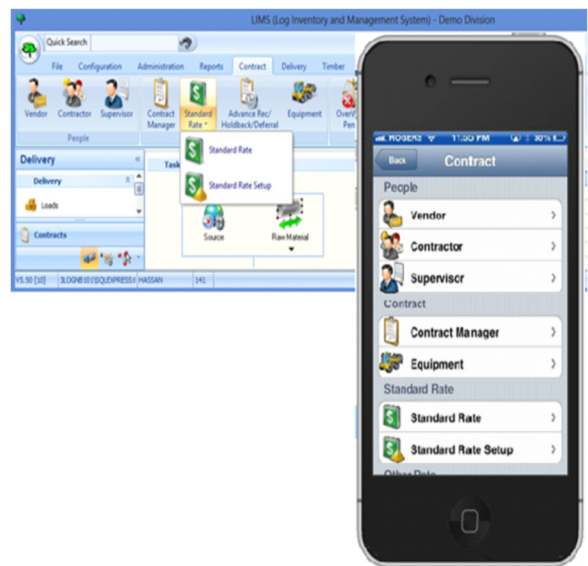
System available from a Smartphone

The system is scalable and can accommodate businesses from single locations to complex, multi-divisional operations. Our specialized software was created exclusively for the wood products industry and can be accessed in the office or remotely.